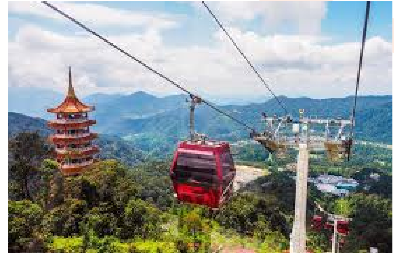
Genting Highland Cable Car