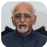
Mhd. Hamid Ansari Former Vice President of India