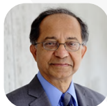
Prof. Kaushik Basu C. Marks Professor of International Studies & Economics Cornell University, USA