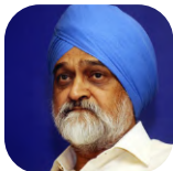
Padma Vibhushan Dr. Montek Singh Ahluwalia Former Deputy Chairman Planning Commission of India