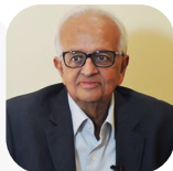
Dr. Bimal Jalan Former Governor Reserve Bank of India