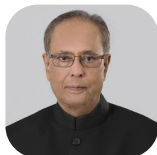
Bharat Ratna Shri Pranab Mukherjee Former President of India