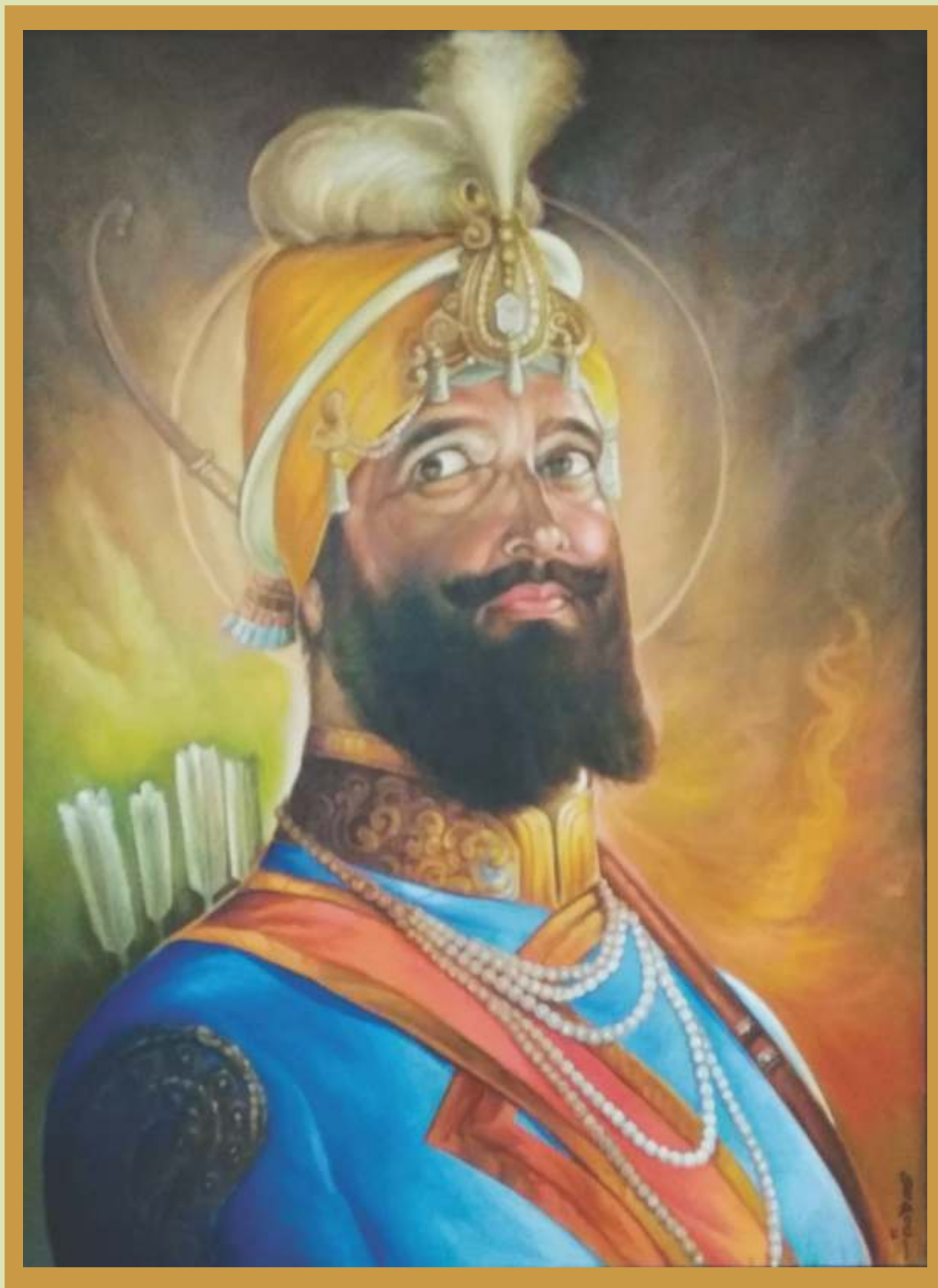
Sri Guru Gobind Singh Ji

Behold All Human Race as One ਮਾਨਸ ਕੀ ਜਾਤਿ ਸਭੈ ਏਕੈ ਪਹਿਚਾਨਬੋ