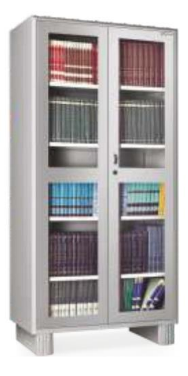
Figure 9: Glass Door Storwel for accounts and admin office representational image.